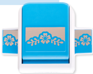
Garden Ruffle Border Punch