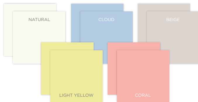
12x12 Cardstock Sampler (10/pk)